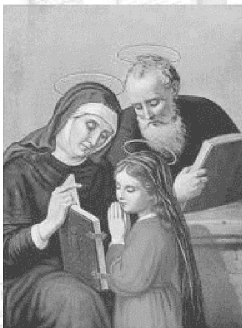
"The Family That Prays Together Stays Together" - Fr. Patrick Peyton, CSC